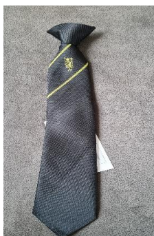
Faulty Tie (two stripes)